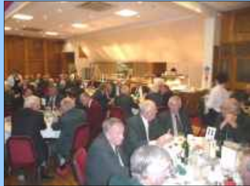
Over 100 Hertfordshire Captains & Past Captains enjoying their lunch after also enjoying the course