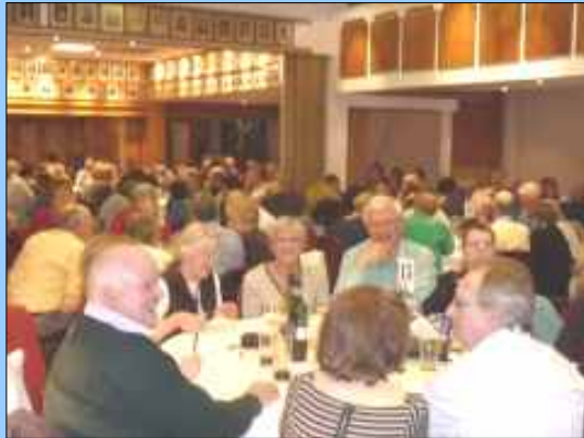
A full house for the ever popular Quiz Night