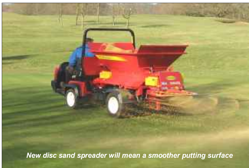
New disc sand spreader will mean a smoother putting surface