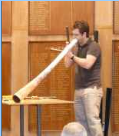
Not too sure this didgeridoo demonstration will replace the Jazz Nights but it sounded great