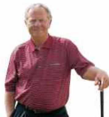
The Big Bear Jack Nicklaus was so kind to me

sent him a hand written letter, telling him about my wish to improve and asking him for any advice he may have. With nothing to lose, I hand wrote a letter.