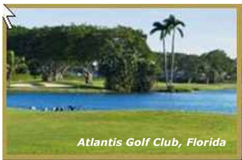
Atlantis Golf Club, Florida